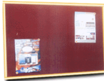
Flannel Pin up board – Elegant White Cedar frames – Wall mountable