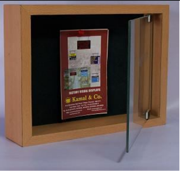
Flannel Pin up board with Glass Enclosure.