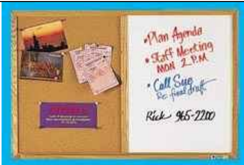
Combination Board – White cum Pin board – Wall mountable