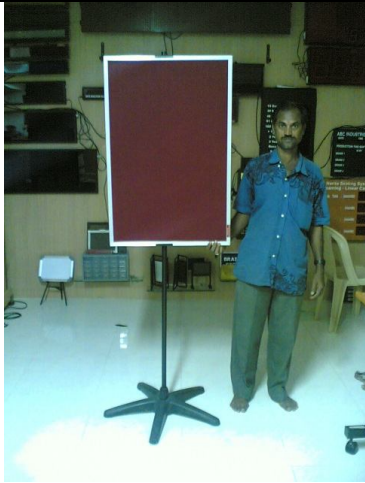
Flannel Pin up board mounted on a Elegant Stand – Steel colour polish on aluminium frames for board