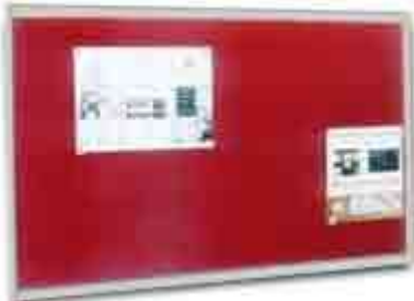
Flannel Pin up board – Simple Aluminium frames – Wall mountable