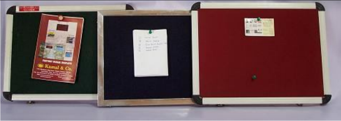
Standard Colours of Flannel – Olive Green, Navy Blue, Rich Maroon