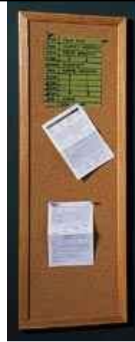
Cork Pin up board – Wall mountable – Framed in elegant - White cedar frames