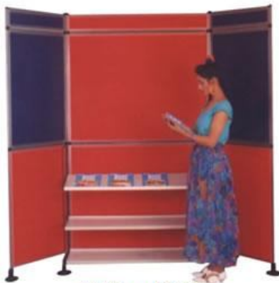
Multipanel Kit 3

MS pipes form a stable frame-work. Plastic clip strips fit into this framework and hold the panel infill. The standard infill is of synthetic material covered with info fabric. This can act as a pin board or one could use Velcro tape.