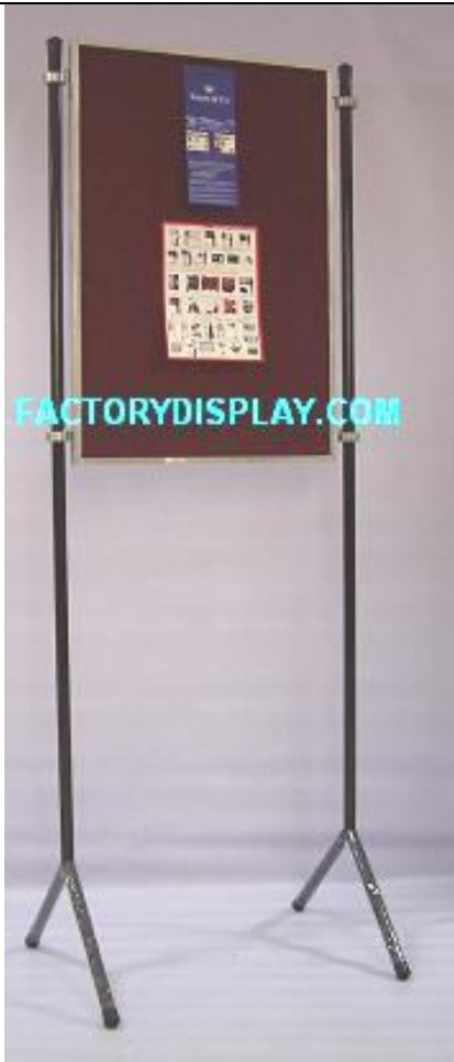
Pin up board on a pair of Inverted "V" Stands