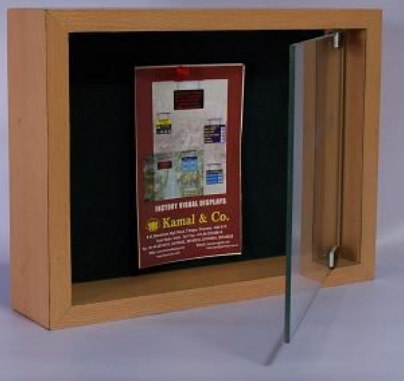
Glass enclosed pin up board – Wood Finish