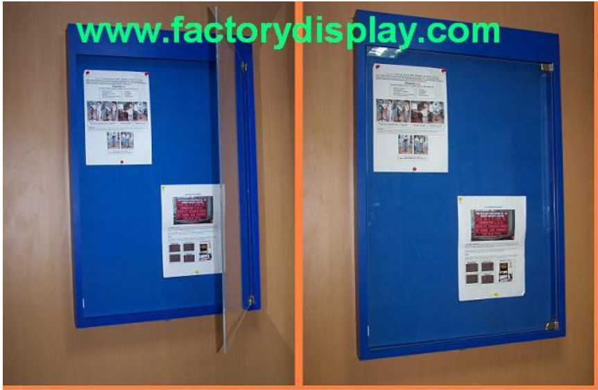
Flannel pin up board with glass enclosure and Light Fitting (OPTIONAL)