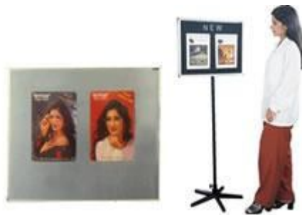
Flannel Pin up board mounted on a Elegant Stand