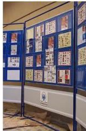
Space for Branding and Logo fixing provided at the bottom grey panel