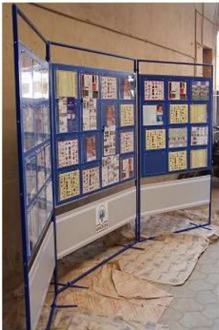
Interconnecting Panels with A4 acrylic folders.