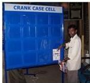
16 Numbers A4 folders on a Stand