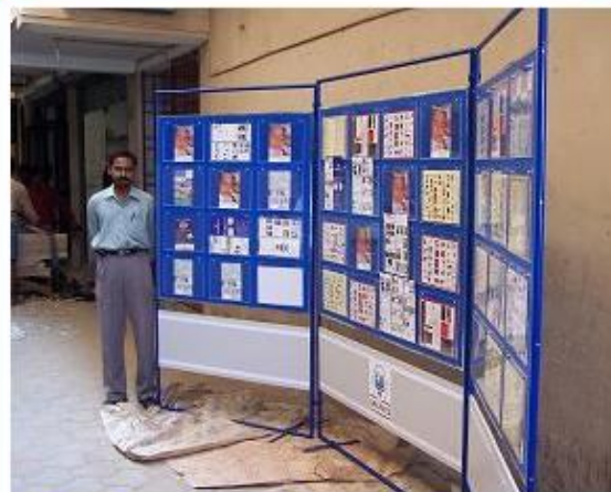
Panels can be made to your dimensions Height of panel 78 inches from floor

See the extra bottom support provided at the bottom to prevent the panels falling off due to high air velocity in the workplace