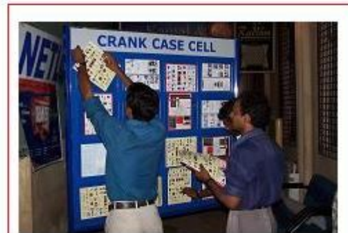
6 inches space at the top for Branding / Name