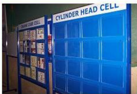
Approximate length 60 inches and 54 inches Height